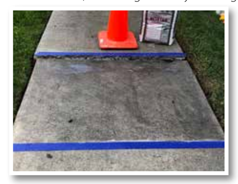
A trip and fall liability hazard.

Trip and fall hazards are an extremely common problem in almost every city. Elephant Armor® allows you to permanently repair a trip and fall hazard, extending the lifecycle and giving you the look and longevity of a newly poured sidewalk.