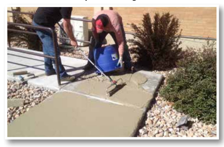
Elephant Armor ^{\circ} rolled over pre-primed surface using \frac{1}{4} " gauge.