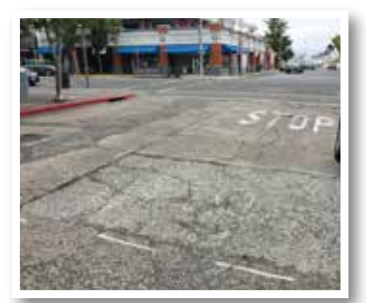
Failing broken and degraded concrete panel.

It is no longer necessary to follow traditional Remove and Replace methods of repair for failing concrete roadways. By significantly reducing the time of repair, a new lifecycle can be achieved with minimal environmental impact. This will also reduce repair costs by as much as 75%.