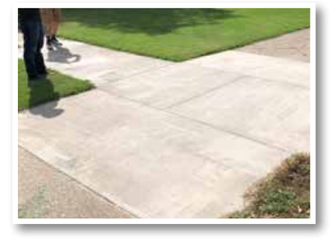
Finished project opened to foot traffic within an hour of completion.