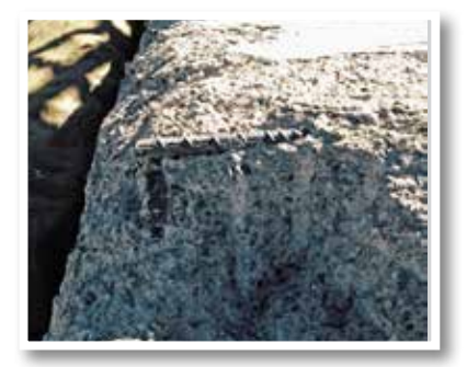
Spalled concrete with exposed rebar.

By using Elephant Armor® on the Slide Mountain KTVN Tower Base Repair , located at 10,000 ft in the Sierra Nevada Mountains, there was a 75% reduction in costs vs the traditional repair method specified.