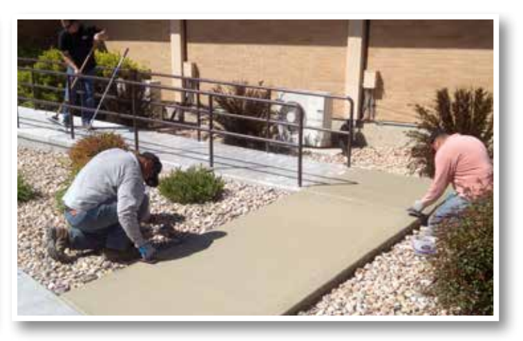
Overlay being finished using traditional finishing tools.