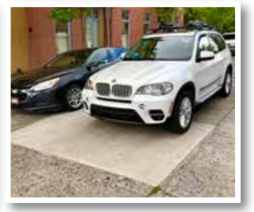
After three years of continuous service.