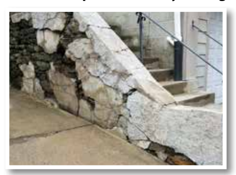
Severely degraded vertical wall.