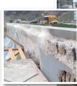
Severely degraded sea wall repaired three years ago using Elephant Armor®

This historic Sea Wall in San Francisco which had been severely damaged by long term exposure to salt water, was given new life by encapsulating it with Elephant Armor® Ultra High Performance Mortar. Treated with GST's Stain Block Elite sealer, this historic monument should see decades of new life without future failure.