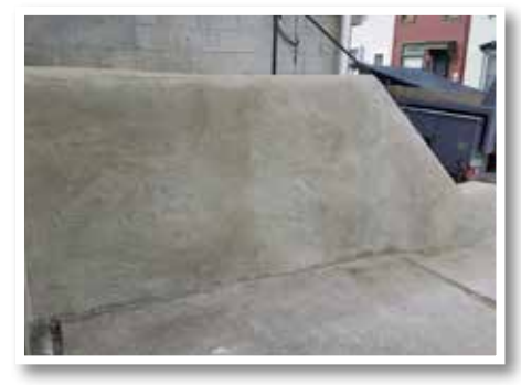
The degraded wall has been given a new life cycle and a brand new appearance.