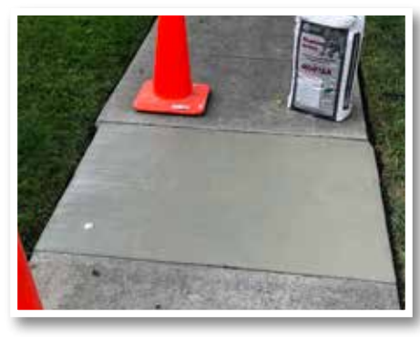
The area was resurfaced with Elephant Armor® without deconstructing the failed surface.