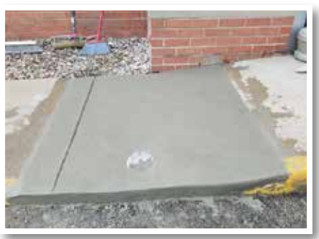
No forming was necessary to extend the life cycle.