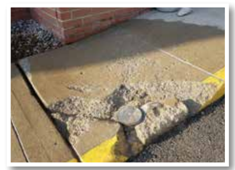
Severely degraded sidewalk causing trip hazard.

Elephant Armor® was used on this sidewalk repair to eliminate multiple trip and fall hazards. Working around utility covers often requires deconstruction of existing concrete. Elephant Armor® allows the contractor to reconstruct without removing the failed sidewalk panel.