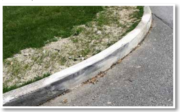
Unprecedented performance with over 5 years of continuous traffic abuse.