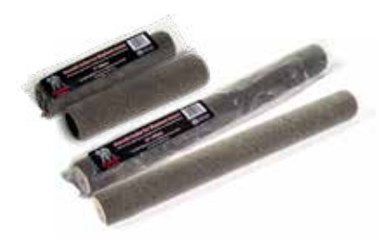
9" (230mm) and 18" (450mm) Smooth Roller