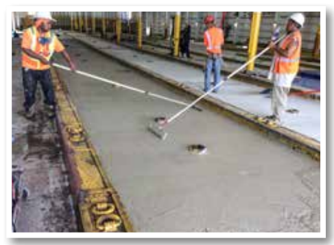
This permanent repair can be done at a fraction of the cost and at a significantly reduced time frame.