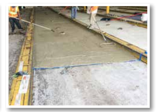
Elephant Armor® overlay is rolled and finished over existing primed concrete to a thickness of ½".