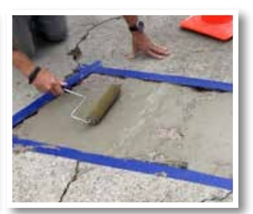
Cracks are pre-filled with Elephant Armor®.