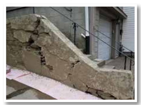
A slurry coat primer is applied prior to Elephant Armor® placement.