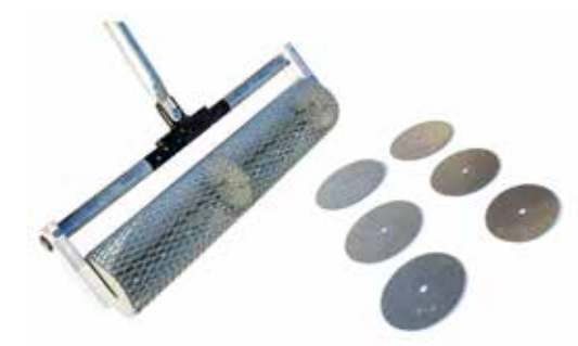
Aluminum Roller with 1/4", 1/2" and 3/4" Depth Gauges (sold separately)