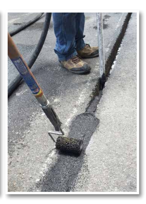
Elephant Armor® Asphalt Repair & Micro-Trenching Reinstatement Material

Elephant Armor® Asphalt Repair being line-pumped into roadway micro-trench for fiber optic cable installation, using a volumetric mixer for an odor free, environmentally friendly, cost effective solution.