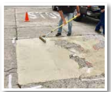
Elephant Armor® being applied using a roller.