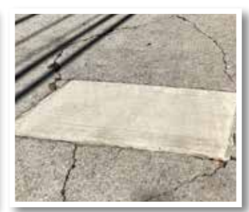
Spall repair one year after placement.