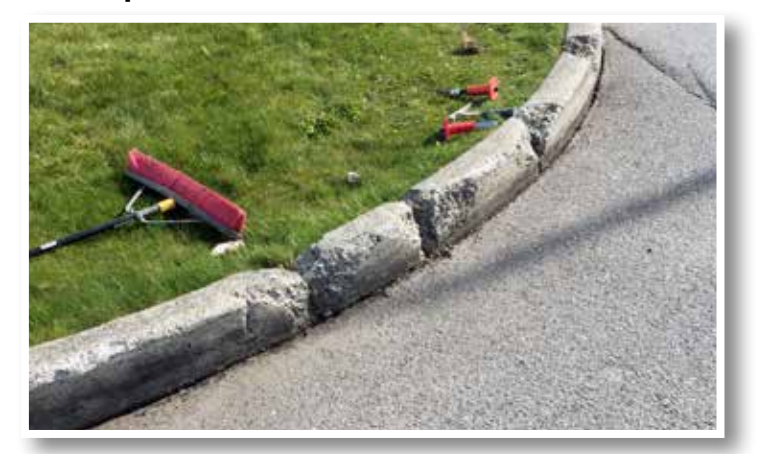
Damaged curb was repaired without deconstruction or forming.