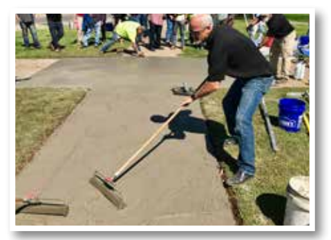
Applying Elephant Armor® using GST's specialty rollers and tools. (see page 11)