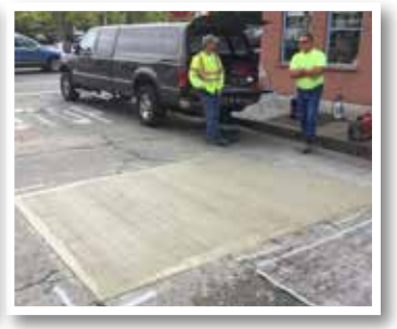
Repair completed with a broom finish.