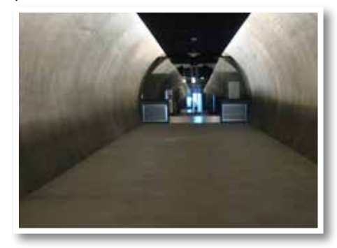
Spray on Elephant Armor® for a structural and architectural finish, greatly reducing construction costs.