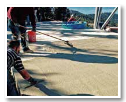
Elephant Armor® applied with rollers and trowels.