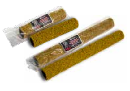
9" (230mm), 91/2" (240mm) and 18" (450mm) Textured Roller