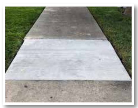
Finished repair with a new lifetime of service. Open for use within two hours of placement.