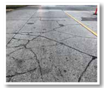
Distressed concrete road in high traffic industrial area.